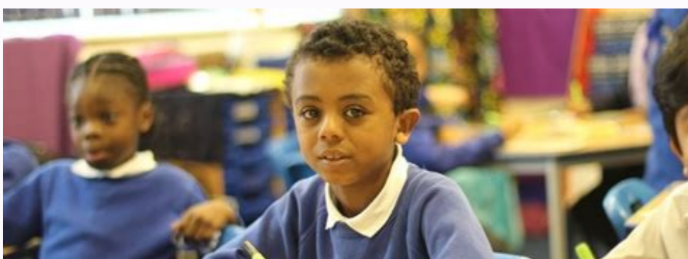
Shirley manor primary school ofsted report.